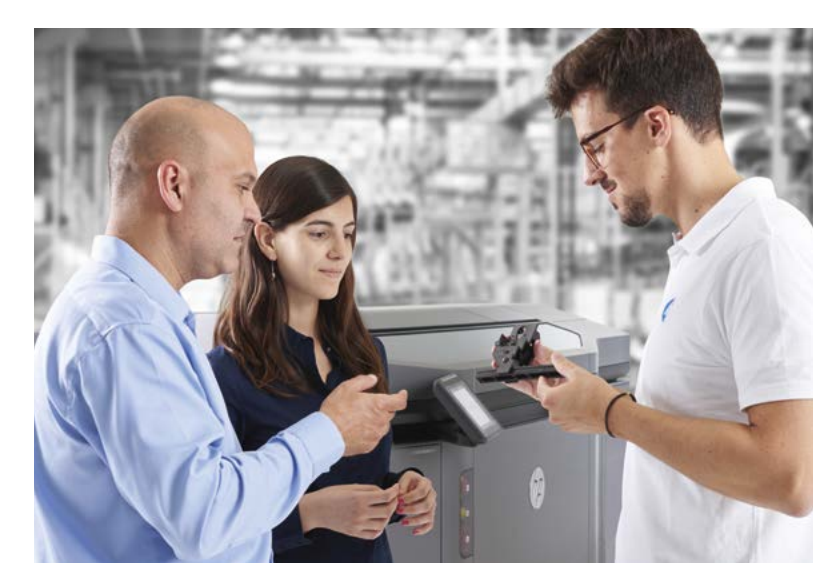
Learn more at hp.com/go/3DSupport

Accelerate your transformation with HP 3D Printing Grow Services , designed to help you grow, move into new materials, applications, and use cases, and further optimize your manufacturing processes.